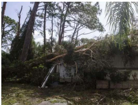
Wind and flood damage to a home in Bonita Springs after Hurricane Irma. Damage not fixed by Jan. 1 can lead to a reduction in property valuations that could save money for affected homeowners.