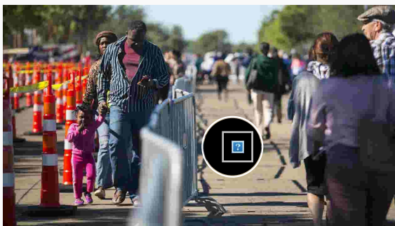
Lee and Collier county residents who were affected by Hurricane Irma waited in traffic and in line to apply for disaster food assistance through the Florida Department of Children and Families on Thursday. The event continues through Oct 31.